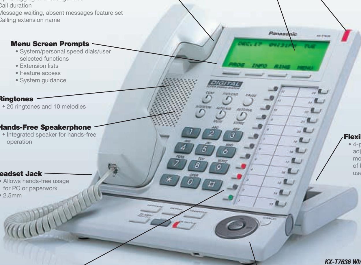
KX-T7636 White Shown