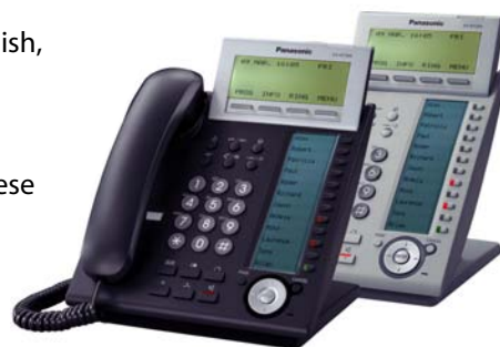
KX-NT300 series IP Proprietary Telephones

The IP telephones offer superb voice quality thanks to handsfree speakerphone and acoustic echo cancellation. The sleek, ultra-modern design, available in both black and white works well with any work environment and office decor.